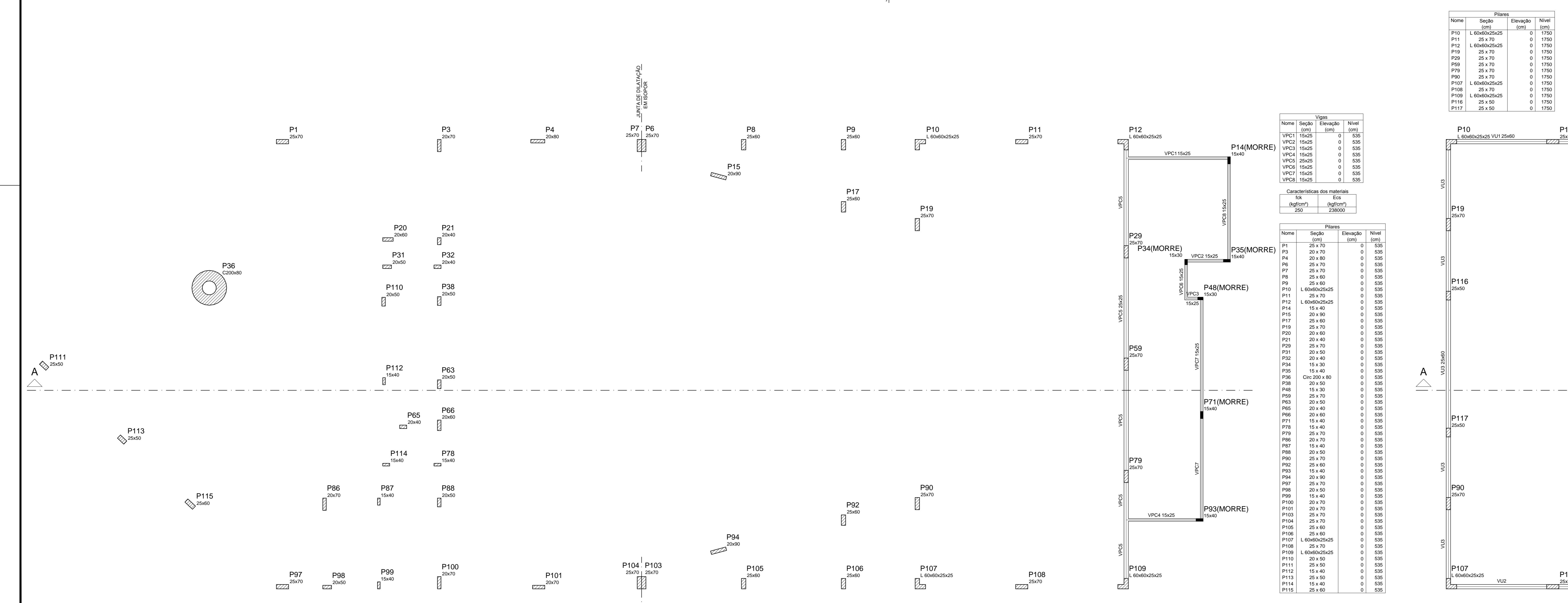
Forma do pavimento Área Técnica escala 1:75